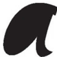
F6 Shadow Blackout